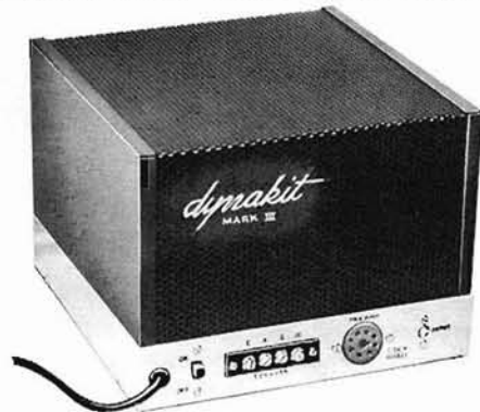
The Mark III: 60 watts for $80.

The extra B+ and bias-supply smoothing are welcome additions to the new Dynakit, too, since they make the amplifier's hum level much less dependent upon output tube balance, and give more assurance that the hum specification will still be met after many months of use.