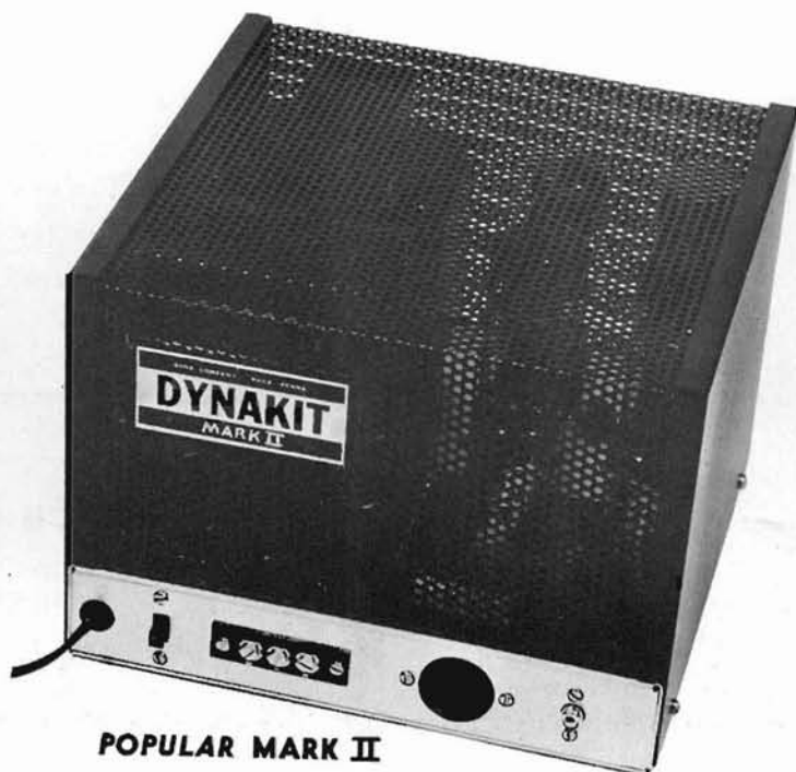
POPULAR MARK II